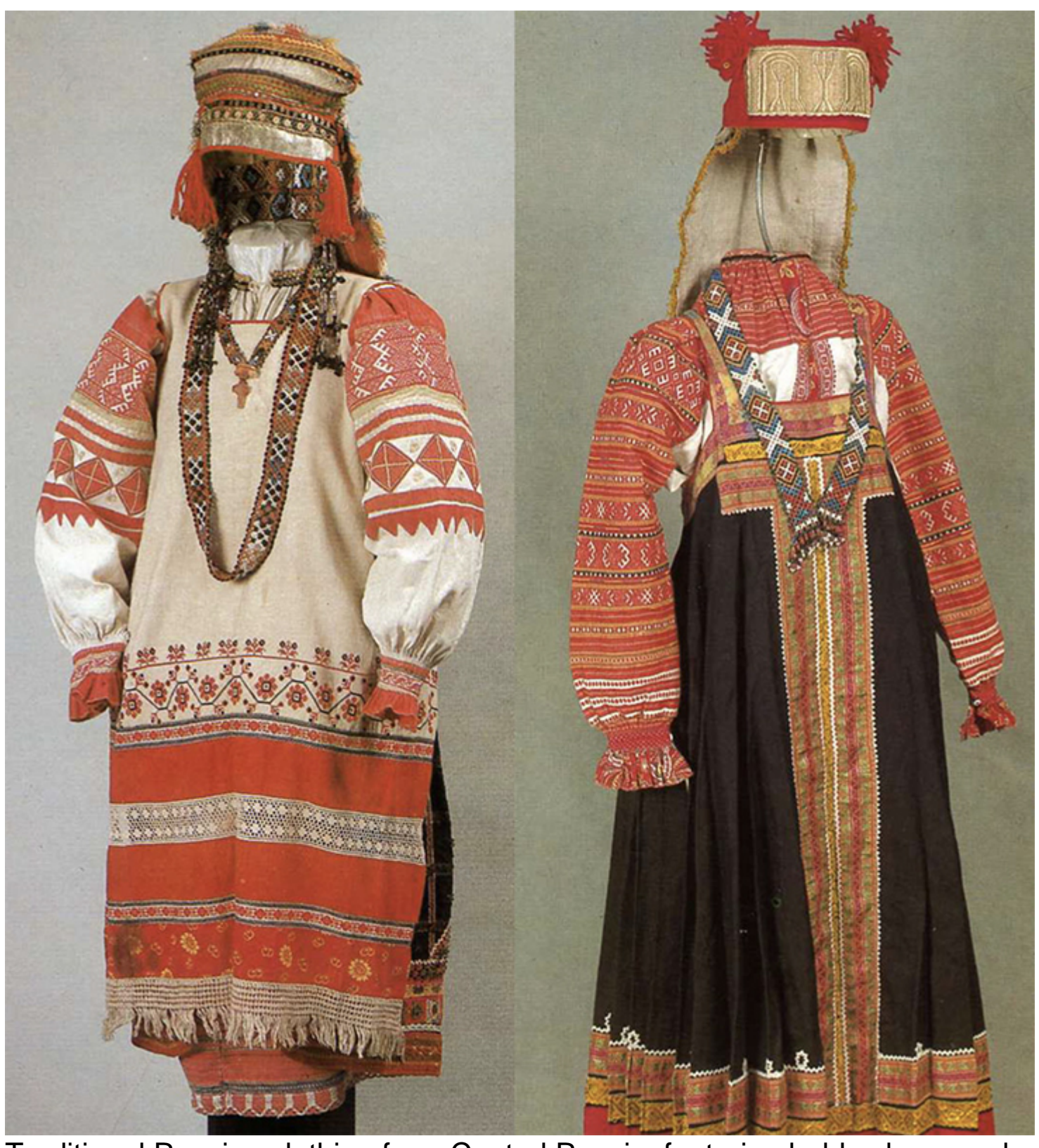
Traditional Russian clothing from Central Russia, featuring bold colours and geometric patterns