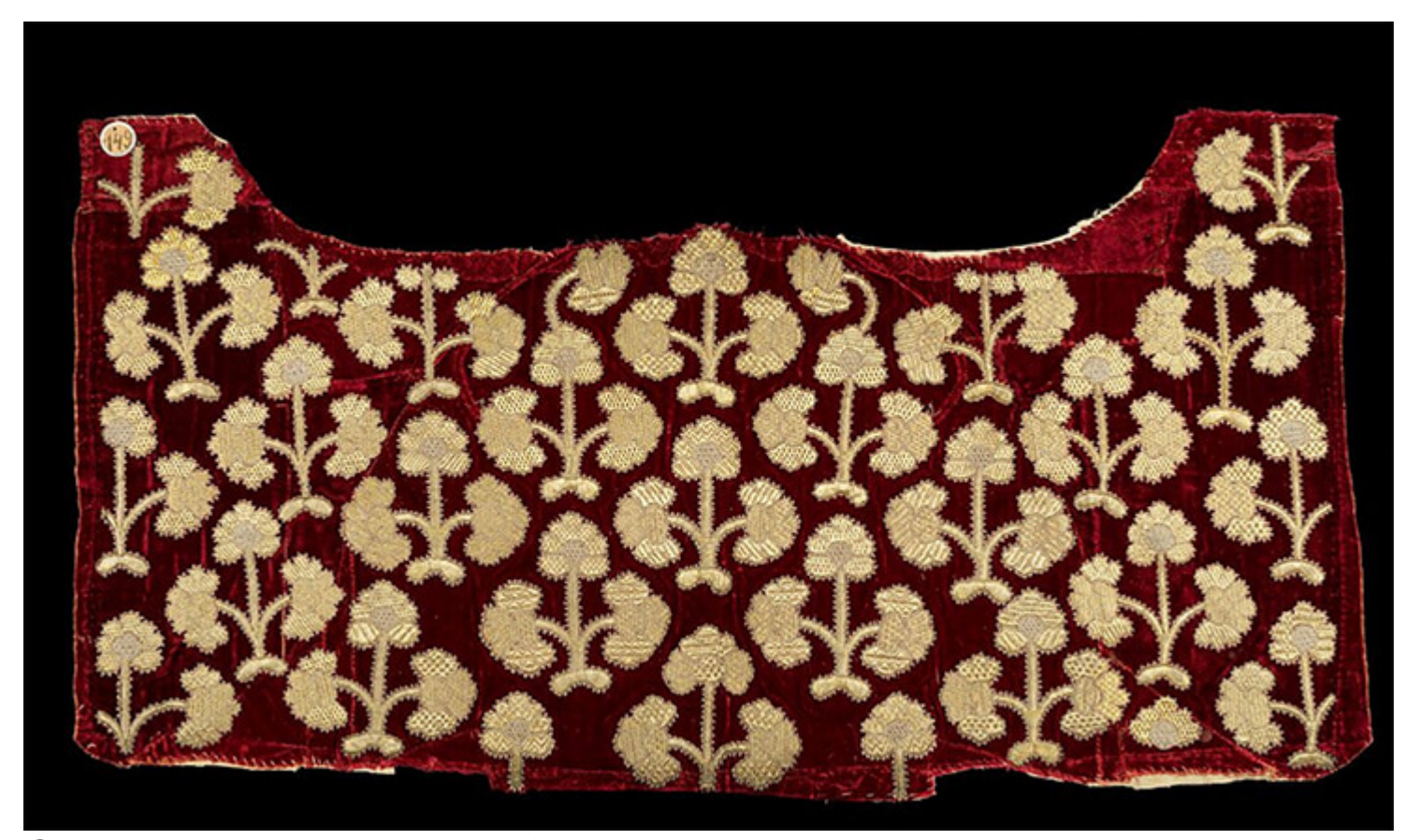
Gold embroidered vestment from 18th century Russia, Metropolitan Museum, New York

Russia, as we now know it, has a long and complex history of embroidery,